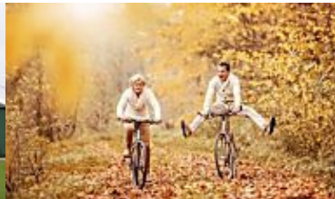
No off switch in retirement. Make the most of later life (Perpetual)