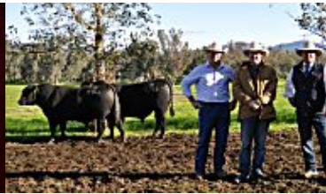
Dunoon's $16,000 top to Vic