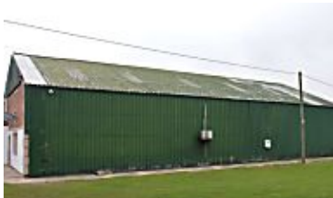
Police Discover 'Farm Shed' Is Actually A Mansion