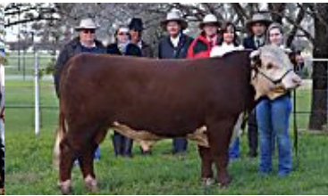
Ironbark's $32,000 high