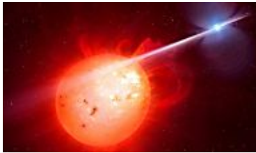
The terrifying reason this star flickers every two minutes