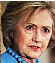
How can YOU profit from the US Election? (Mirror)