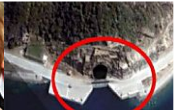
Rare Glimpse at these Secret Abandoned Military Bases (History Fanatic)