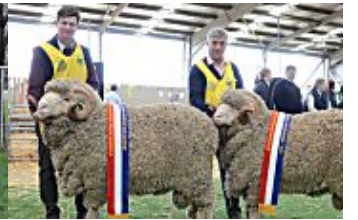
Ribbons go to three states in Merino show